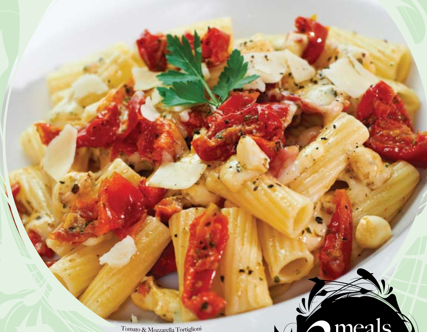
Tomato & Mozzarella Tortiglioni